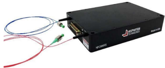
ASE source has only one optical cable