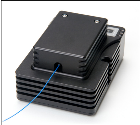
Mount with Cover Installed