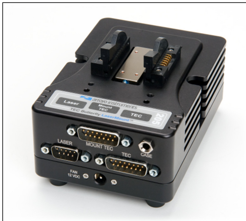
Fan Base Installed (205 LaserMount shown)

The optional fan base (p/n 200-FAN ) replaces the existing bottom cover, so start by removing the four screws on the bottom of the fixture and setting the standard bottom cover aside. Before screwing on the fan base, you first need to plug the fan in. You will find a black, two-pin socket inside the fixture that is wired to the TEC (or Mount TEC) connector. The fan base has a matching two-pin plug. It is easiest to place the mount on its back, insert the plug into the socket, and lower the fan base onto the mount. Take care that you do not pinch the fan wires (or any other wires) between the mount and the base.