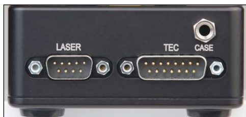
203-10PIN Butterfly LaserMount Connectors