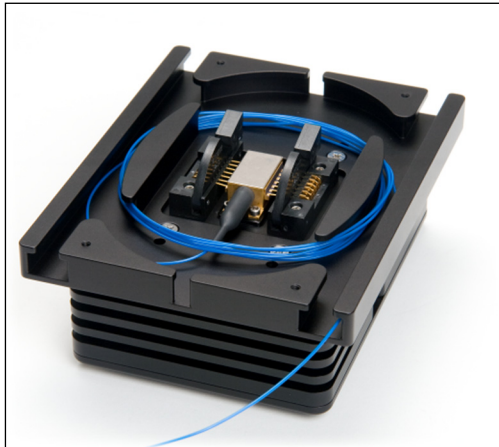
Mount with Fiber Management Tray Installed

The 203-10PIN offers an optional fiber management tray (p/n 200-TRAY ), which makes managing excess fiber much simpler by providing a protected area to coil the fiber. Unlike other solutions that use ties to retain the fiber, our fiber tray has an upper lip that catches the fiber, retaining it gently without needing any ties. To install the tray, simply use the provided screws. Note that if you will be using the cover and screwing it down, you will need to install only the front two screws, as the socket head screws that come with the cover will use the rear two threaded holes.