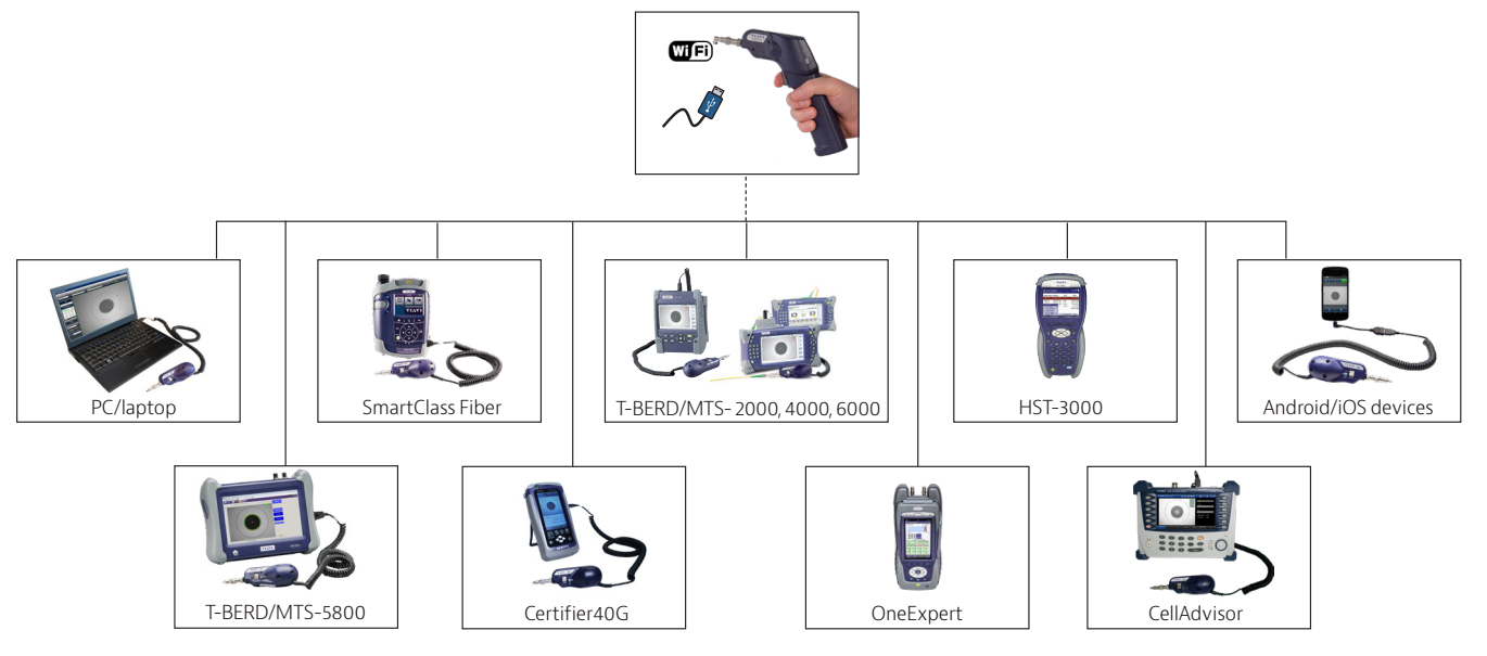
Connectable VIAVI devices include: SmartClass™ Fiber family, T-BERD®/MTS family, OneExpert™ (ONX) family, CellAdvisor®, Certifier40G™, and MP-60 optical power meter

As an all-in-one inspection solution, the FiberChek probe rarely needs to connect to other devices. However, many technicians already use other devices as part of their testing and do not want to disrupt their existing workflows. That's why FiberChek integrates with other VIAVI test devices to significantly improve productivity when you use them together. FiberChek can function independently of another test device, saving time by letting technicians test their next ports while an existing test is still in process.