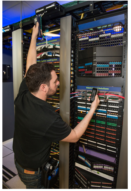
Viewing FiberChek probe results on a smartphone